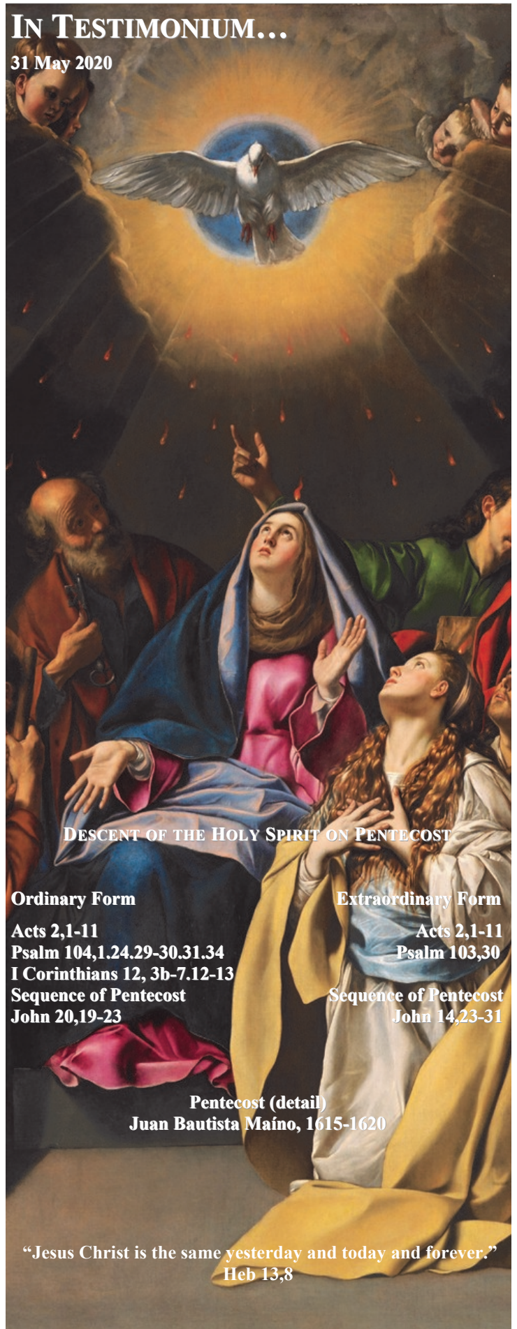
DESCENT OF THE HOLY SPIRIT ON PENTECOST