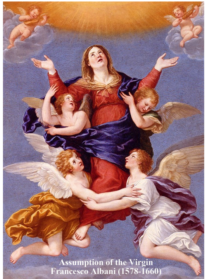
Assumption of the Virgin Francesco Albani (1578-1660)

Not a Holy Day of Obligation this Year since it falls on Saturday. Then again, Sundays have not been Holy Days of Obligation for most of this year anyway.