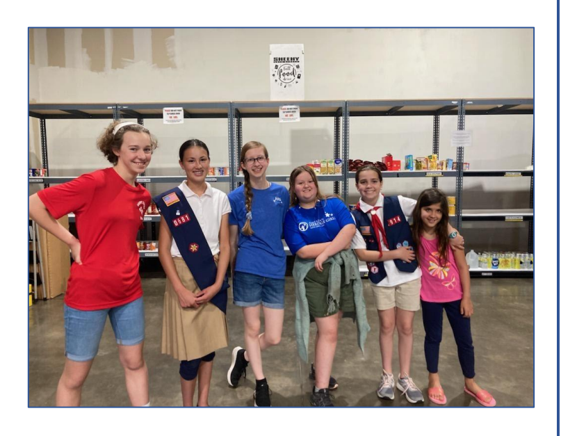
Empty shelves upon arrival at St. Lucy Warehouse