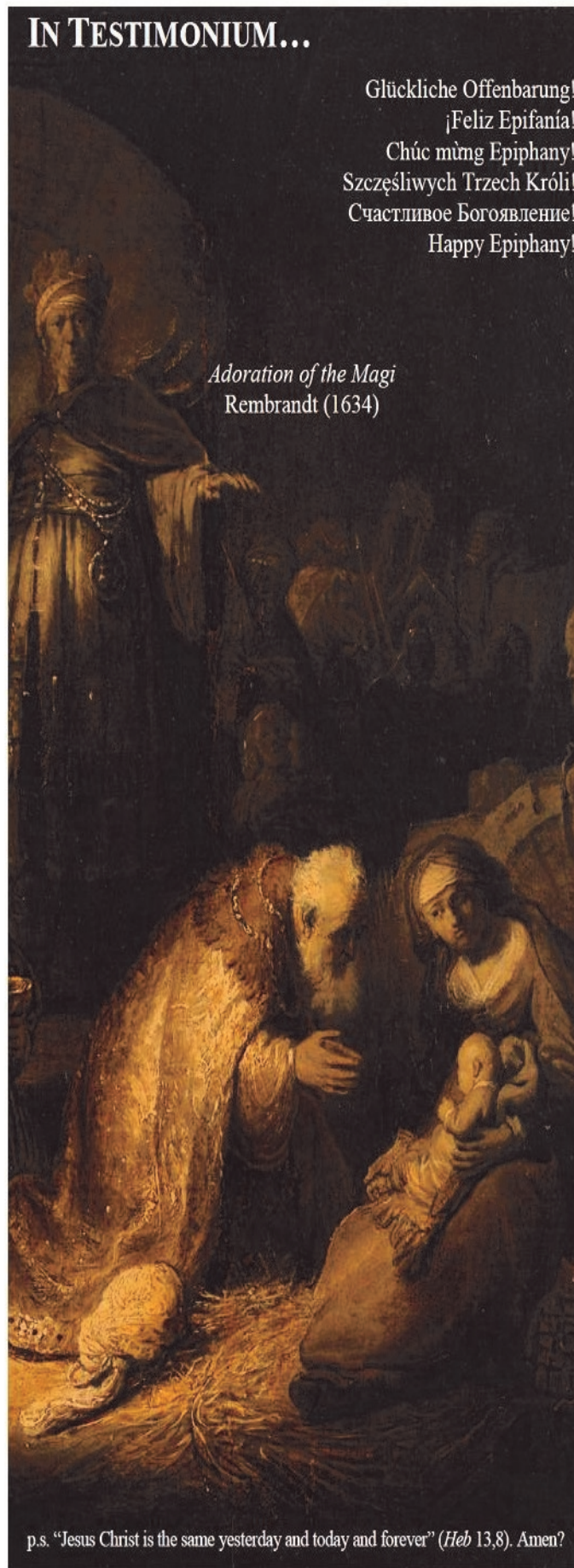
Adoration of the Magi Rembrandt (1634)

p.s. "Jesus Christ is the same yesterday and today and forever" (Heb 13,8). Amen?