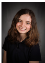
Elizabeth Langley HS