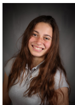
Barbara Oakcrest School