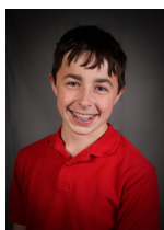
Michael McLean HS