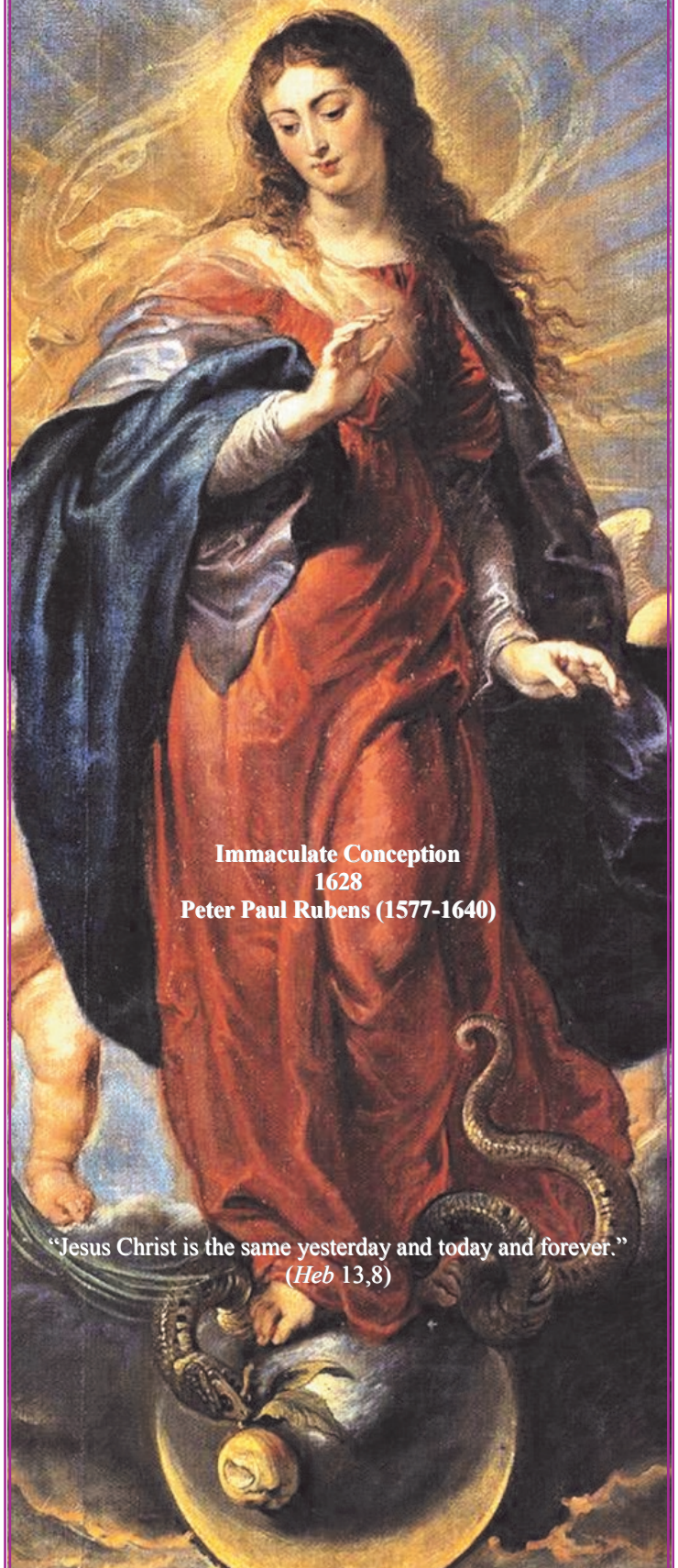
Immaculate Conception 1628 Peter Paul Rubens (1577-1640)

Solemnity of the Immaculate Conception observed on December 9 this year in the Ordinary Form