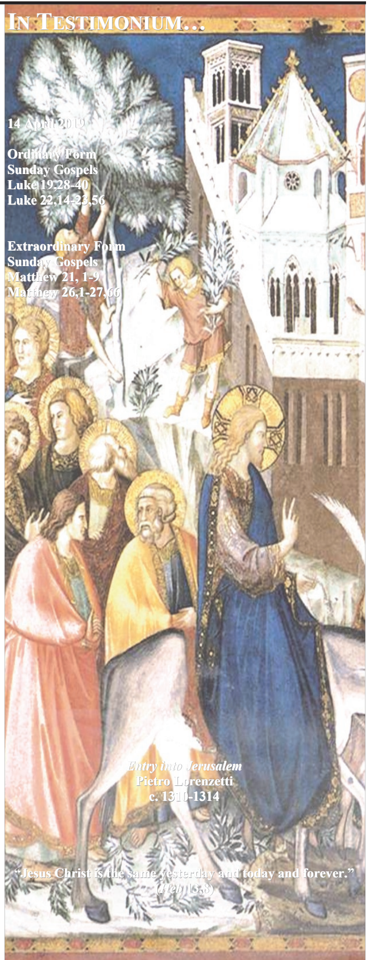
Entry into Jerusalem Pietro Lorenzetti c. 1310-1314

"Jesus Christ is the same yesterday and today and forever." (Heb 13,8)