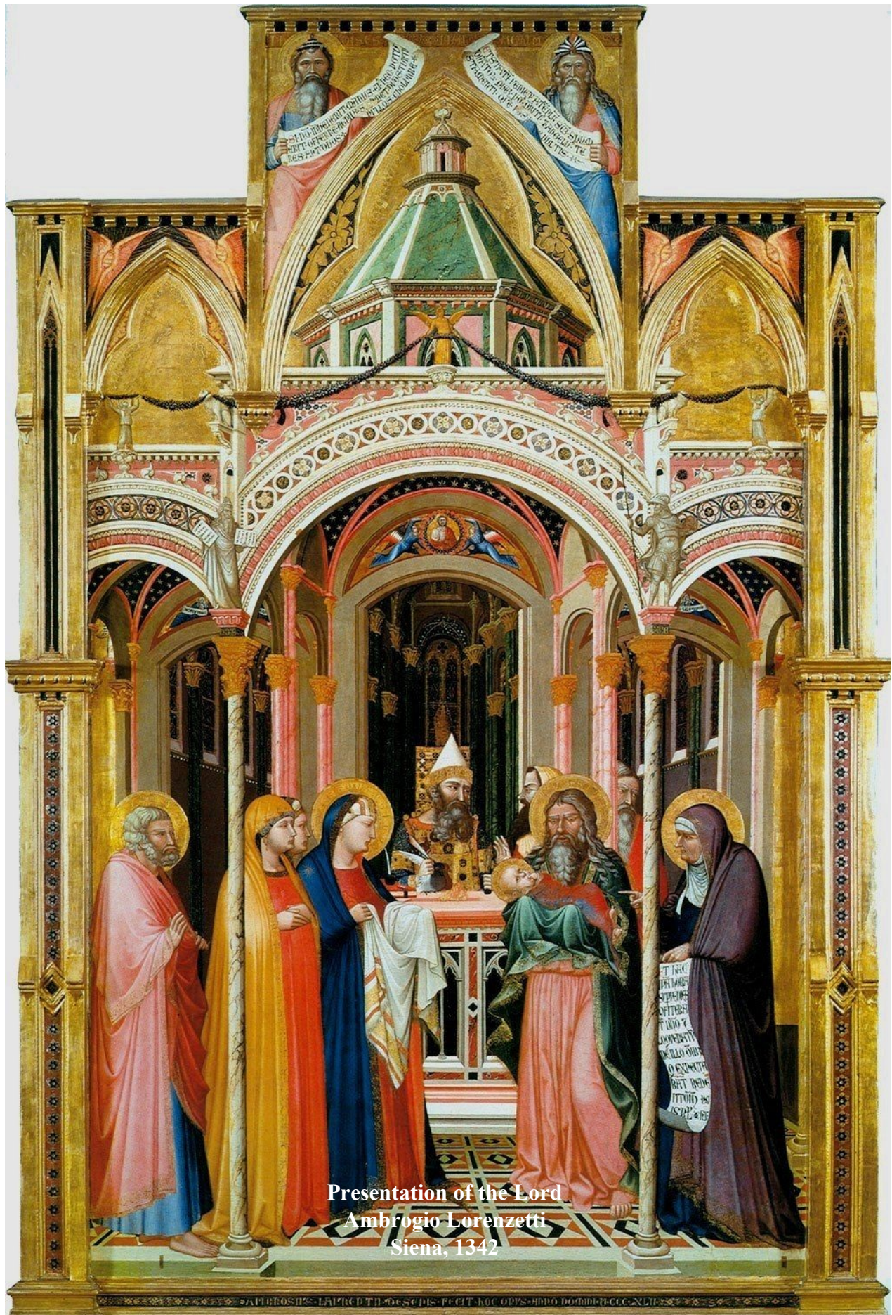
Presentation of the Lord Ambrogio Lorenzetti Siena, 1342