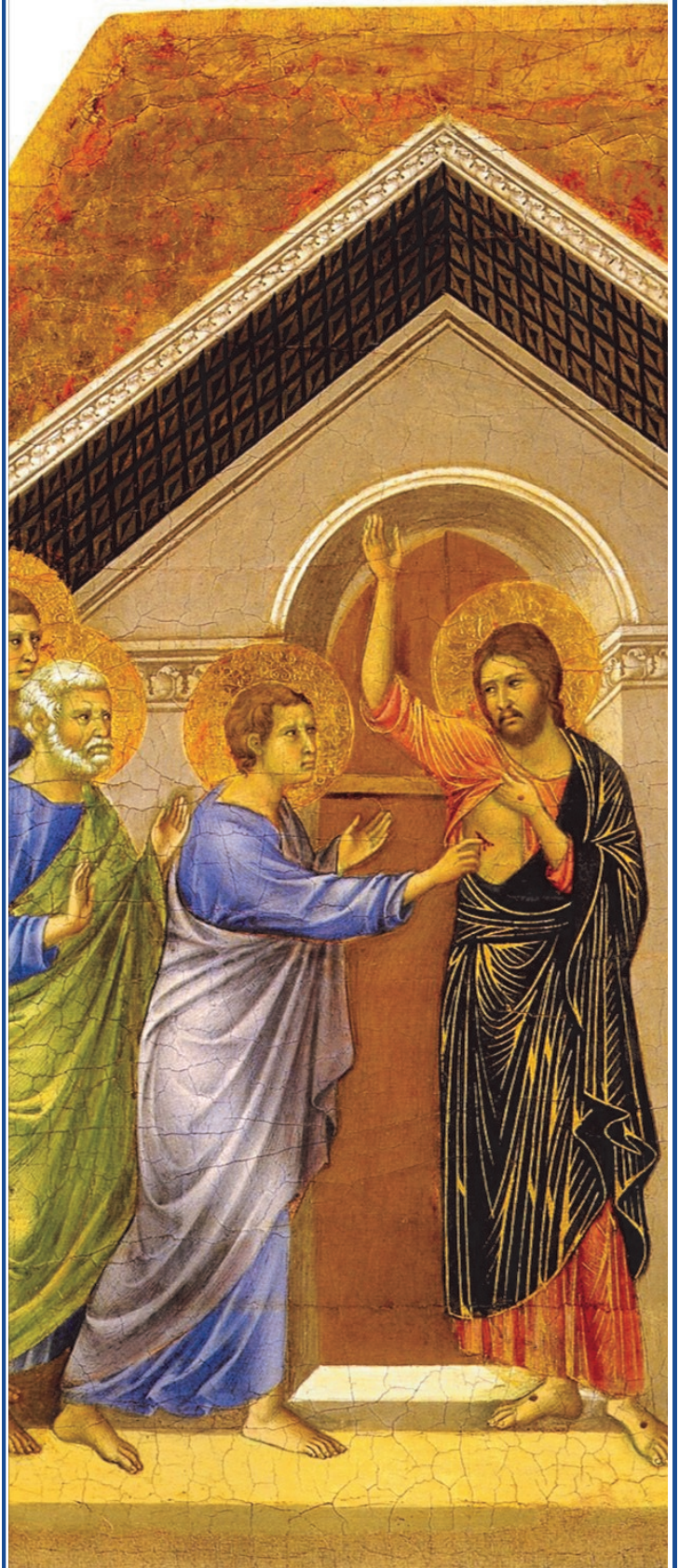
Maestà, Duccio (1308-1311)