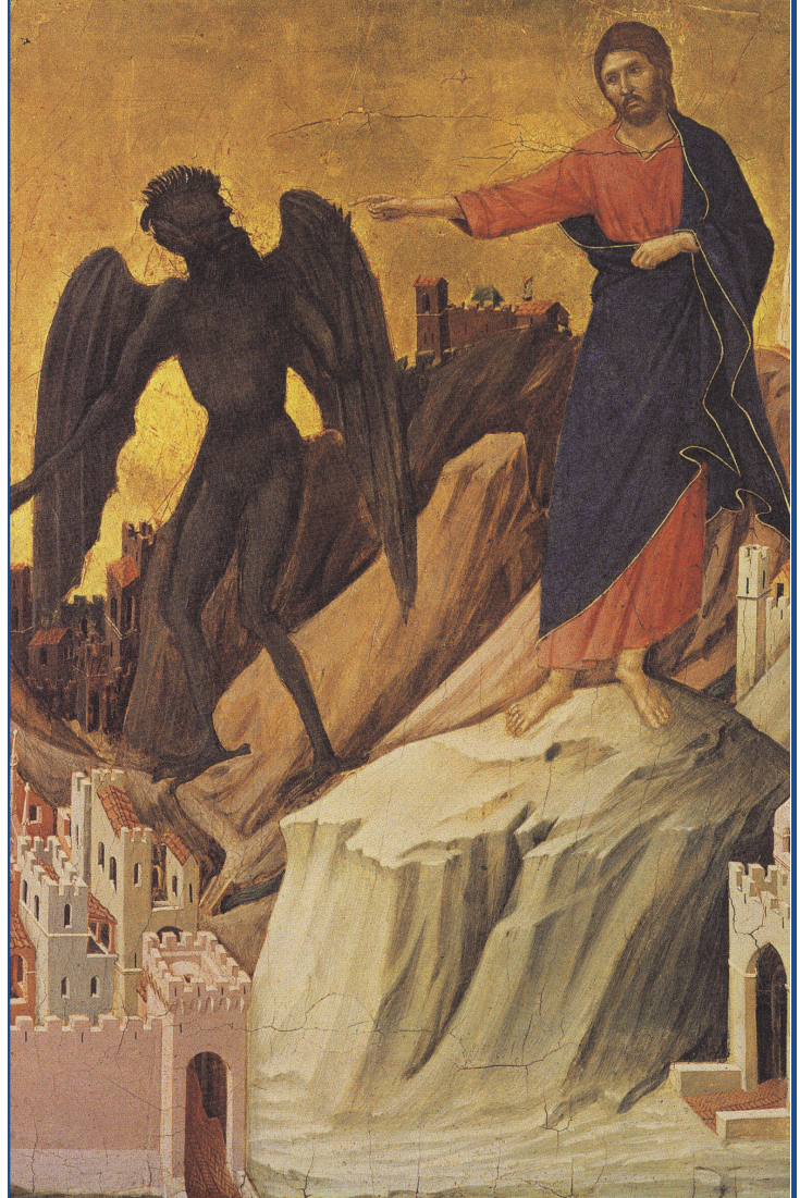
Temptation on the Mount Duccio di Buoninsegna (1308-11)