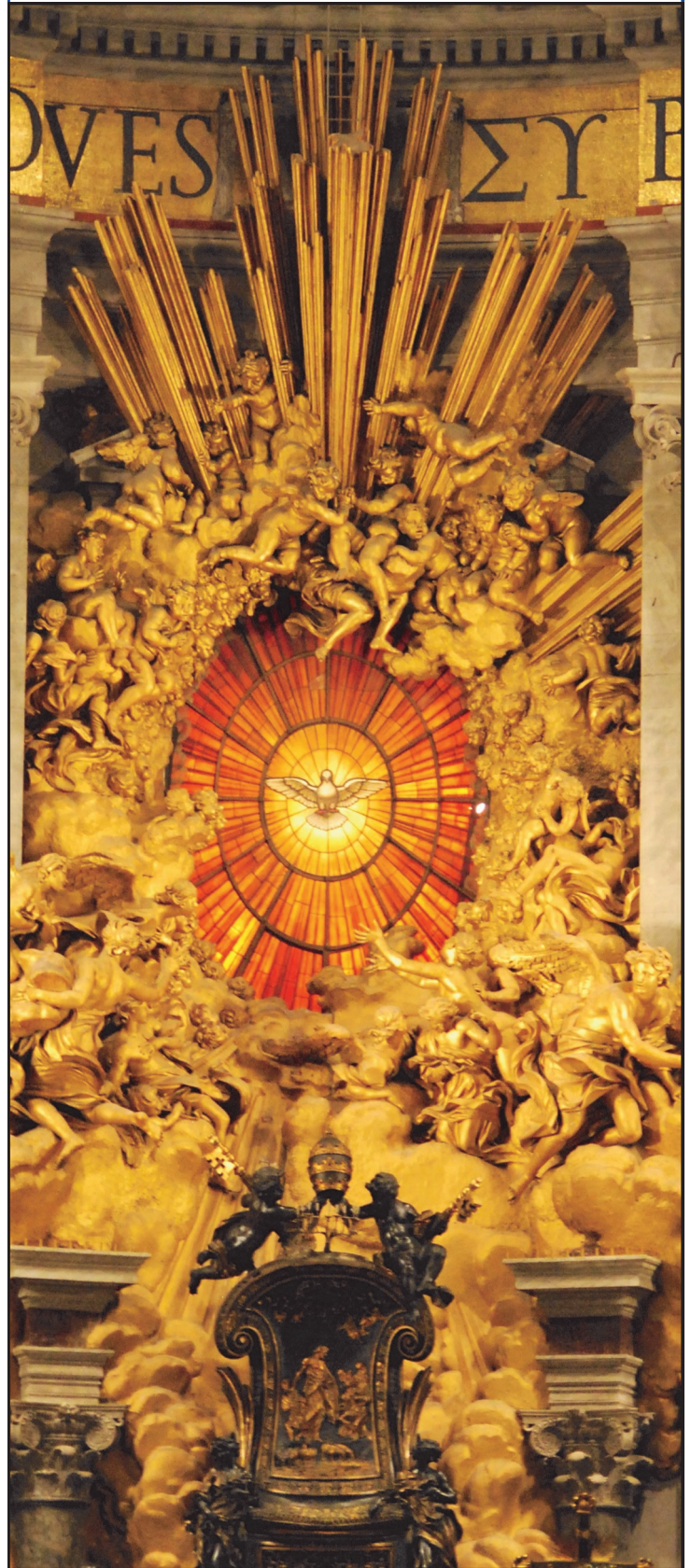
Chair of Saint Peter Gianlorenzo Bernini, 1647-1553