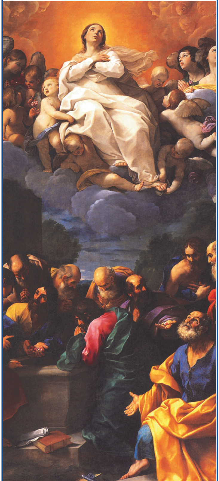
Assumption Guido Reni, 1617