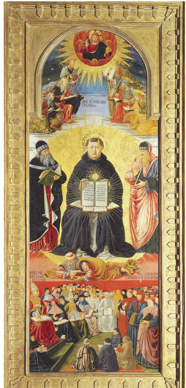
"TRIUMPH OF ST. THOMAS" BENOZZO GOZZOLI (1470-75) LOUVRE MUSEUM, PARIS