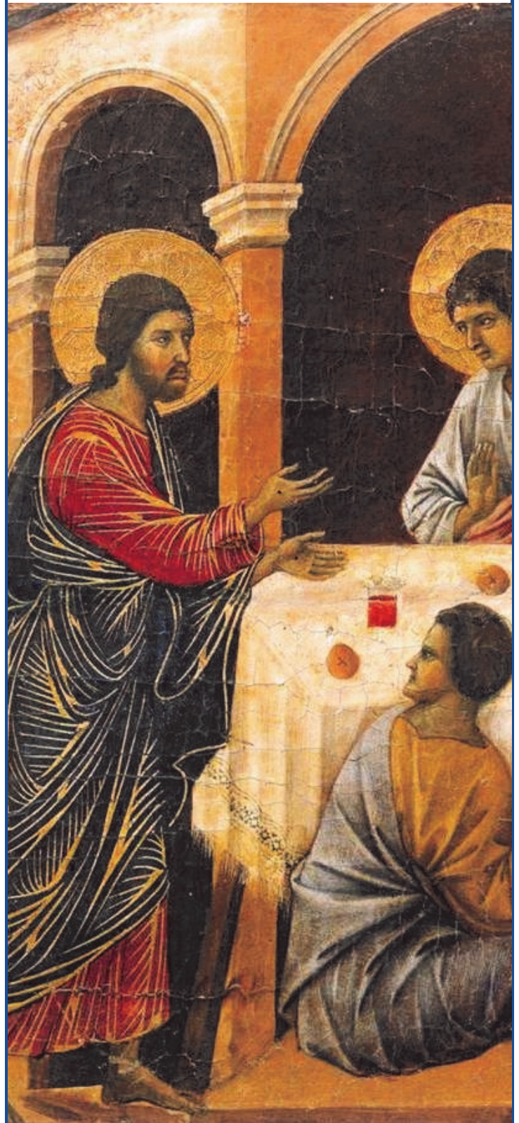
Risen Christ Appearing to the Apostles from Maestà by Duccio di Buoninsegna (1308-1311)