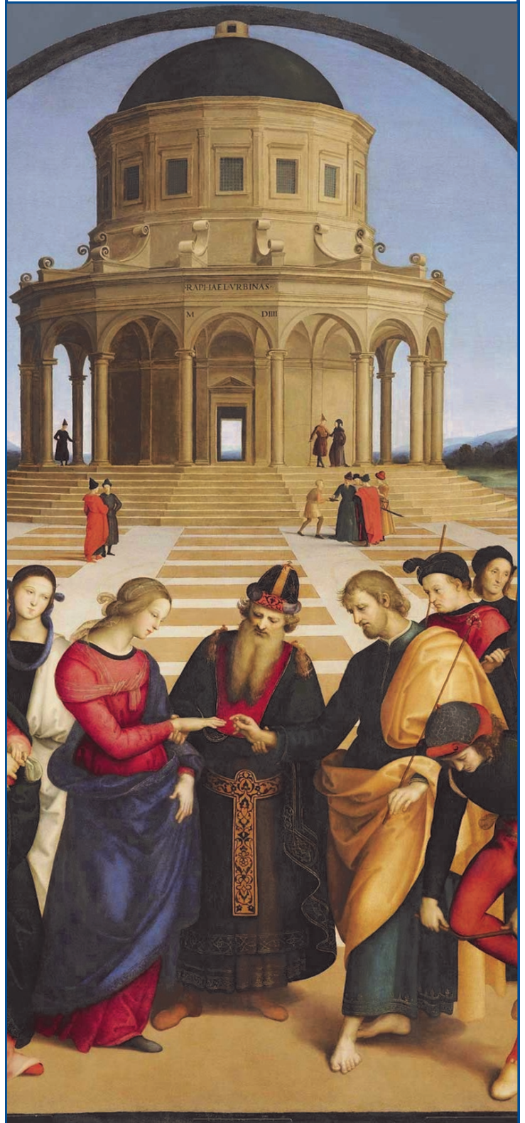
The Marriage of the Virgin Raphael, 1504 (Pinacoteca di Brera, Milan)