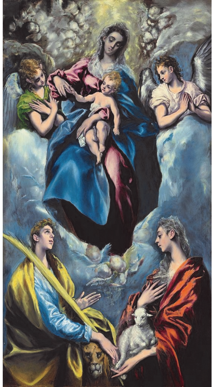
MADONNA AND CHILD WITH SAINT MARTINA AND SAINT AGNES