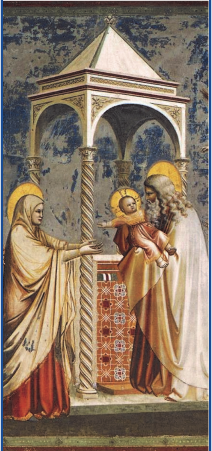
Presentation of Christ at the Temple (Giotto, 1304-1306)