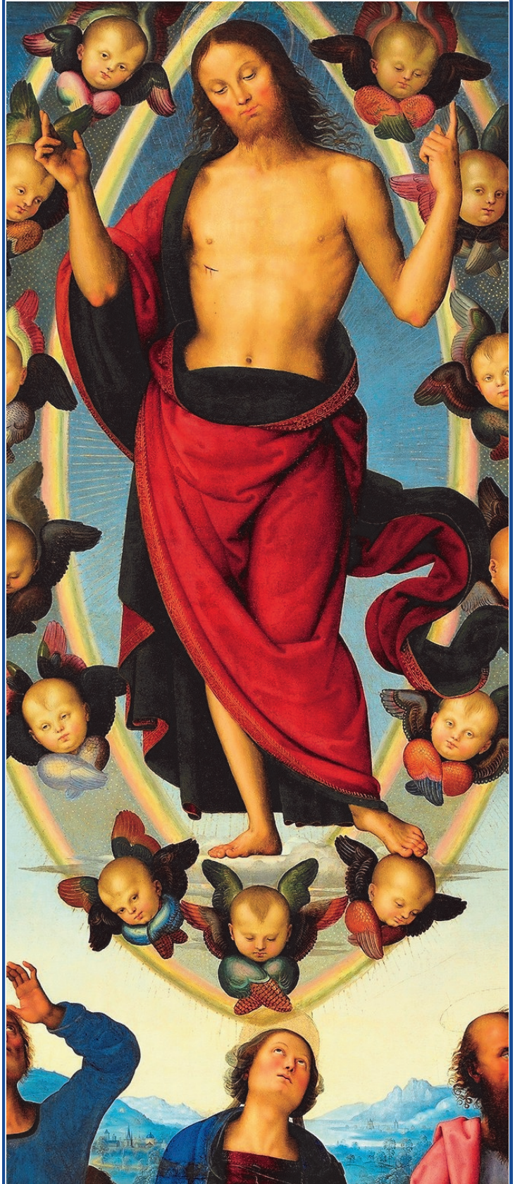
Ascensione di Gesù Pietro Perugino, 1496-1500 detail