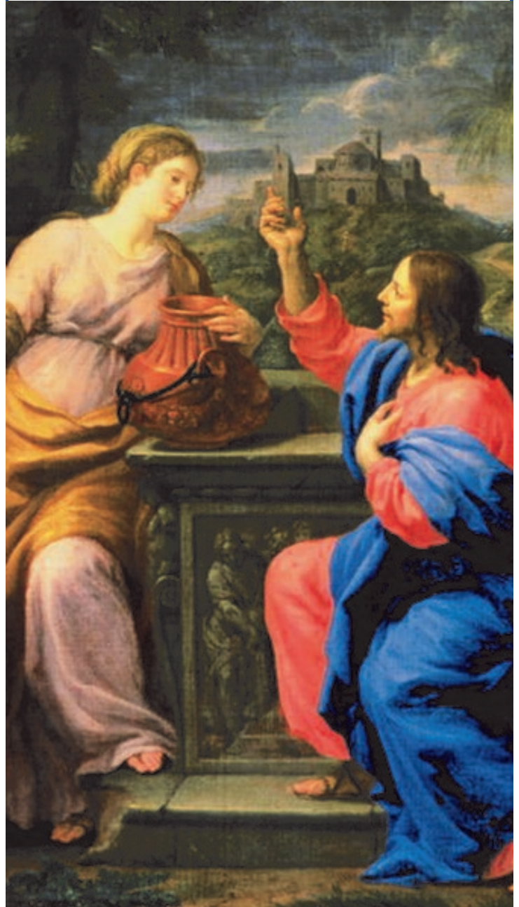
Christ and the Woman of Samaria at the Well Carlo Maratta (1625-1713)