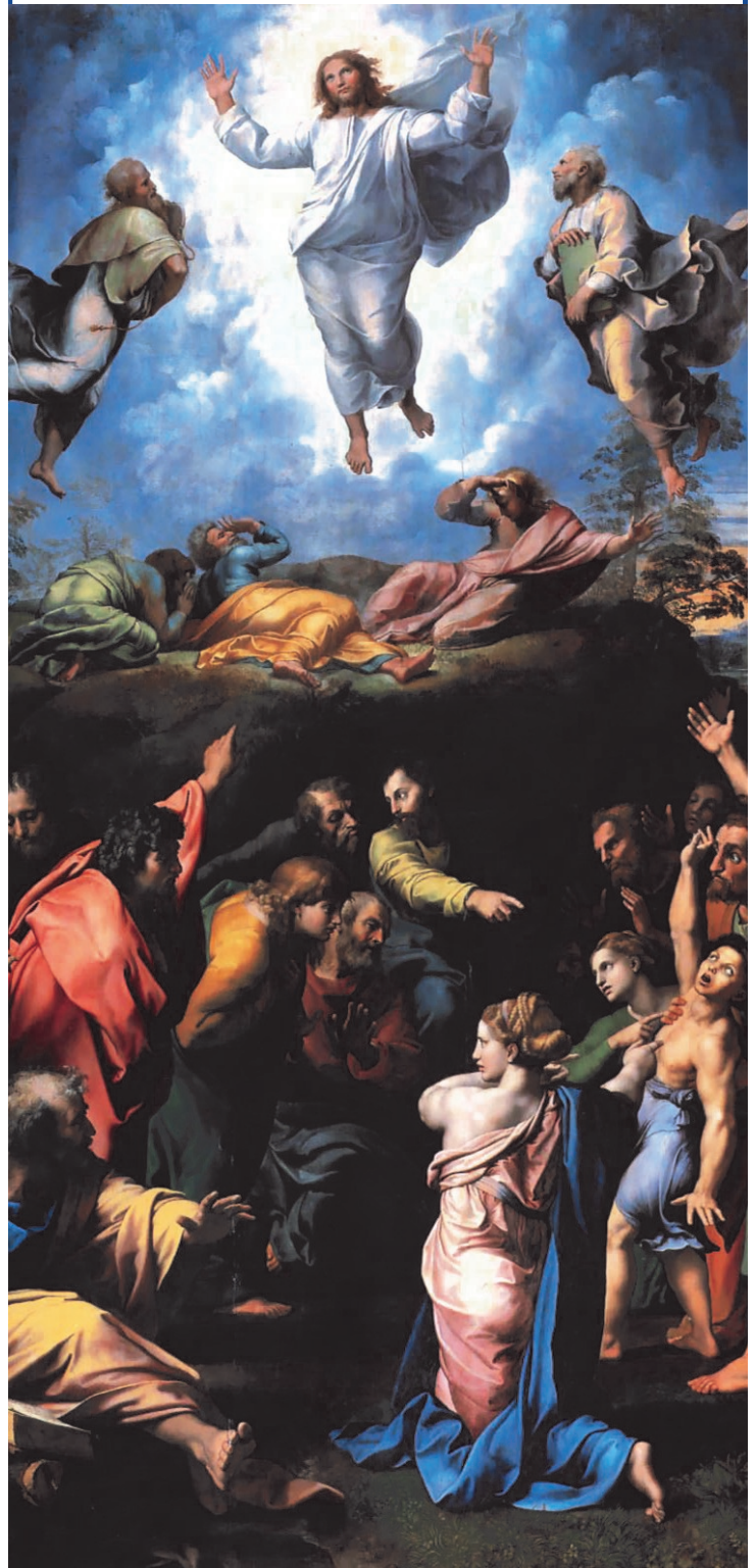
Transfiguration Raphael (1516-1520)