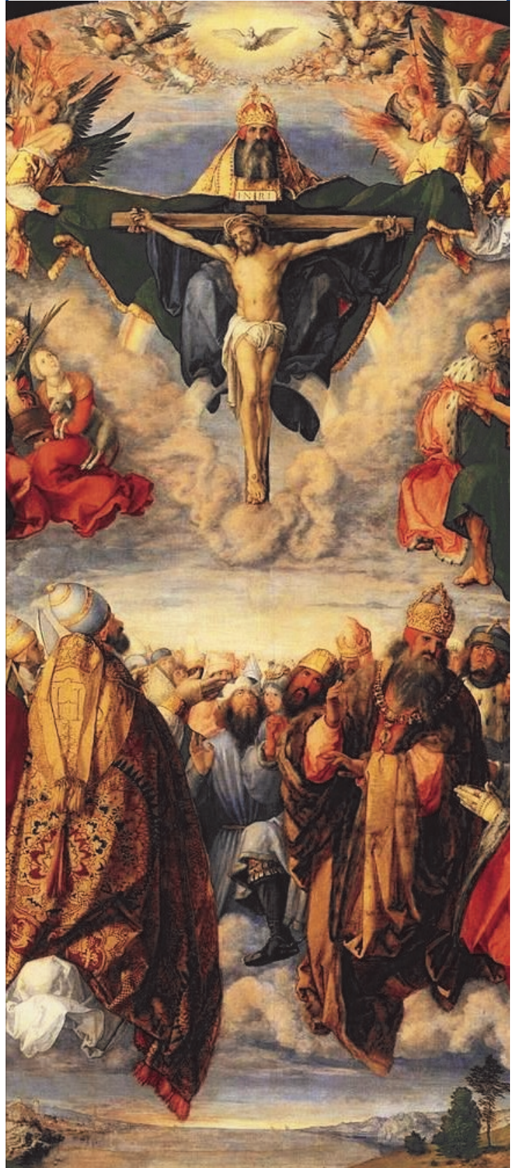
ADORATION OF THE TRINITY (detail) Albrecht Dürer (1509-1511)