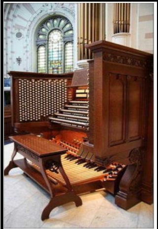
Five-manual console for the organ at the United States Naval Academy Chapel .