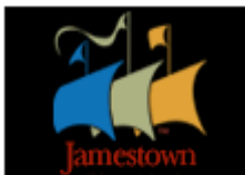
America's 400th Anniversary